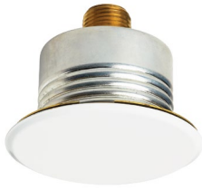
V3801 and V3802